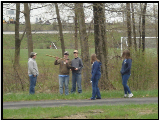
“Jefferson/Clarion High School Envirothon”

The District Environmental Education Program is funded by the annual Bird Seed Sale. Quality bird seed is made available in the fall and throughout the year.