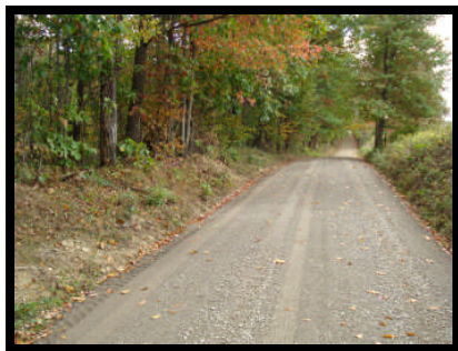
“Dirt & Gravel Road Project”

The District coordinates local, state, and federal resources to provide technical assistance to individuals, private organizations and other government agencies.