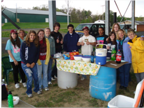
2011 High School Envirothon

The District stays active with environmental education and outreach efforts in the county. A number of displays were set up and manned by District staff. Displays, publications and educational programs were made available at the following events: Jefferson County Fair, Brockway 6 th Grade Conservation Field Day, Reynoldsville Envirothon, Cloe Lake Field Trips, Farm Safety Day, Watershed Festival, High School Envirothon, Earth Day, Project Grass Pasture Walk, Chicken Manure Workshop, and Jefferson County Twp. Supervisors Annual Meeting. Technical assistance, presentations and training is also provided to the local municipalities, contractors, watershed groups and civic clubs.