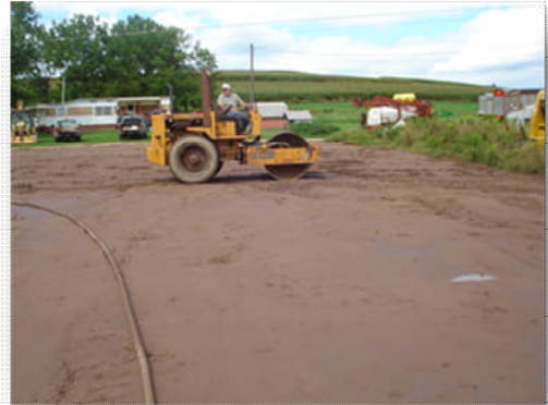
Fly Ash Project – Smith Oak Farm