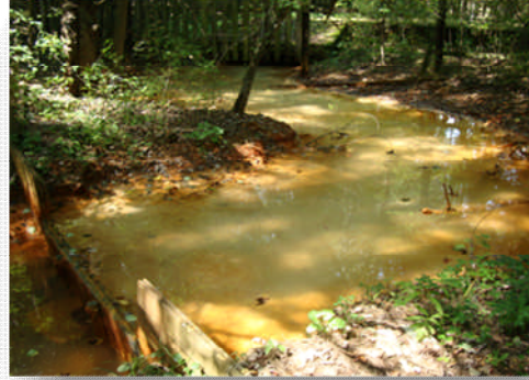
Sugar Camp Run Discharge

The original Conifer Treatment System was built in 1998. The water chemistry changed in 1999. The ferric iron & aluminum in the discharge led to premature plugging of the ALD. In 2003 and 2004 rehabilitation efforts were made. Still, the system is providing very little or no treatment. A project to regrade the limestone in the ALD, and fill a portion of the settling pond with limestone to create a large limestone bed (FeAlMn bed pronounced Fel-al-men) was completed in July, 2010. Water monitoring has indicated improved pH and a decrease in iron content.