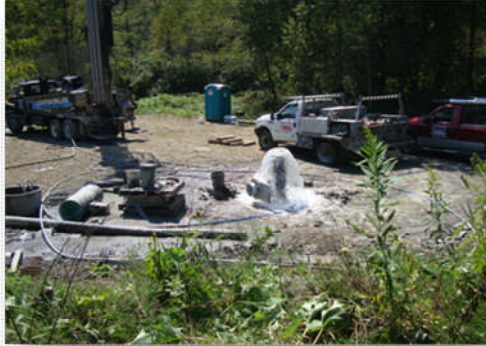
Access Well drilled to relocate mine discharge

Phase II of the Sugar Camp Run Discharge as a Municipal Water Supply is nearly complete. Funding provided by a CEI Growing Greener Grant is being used to install access wells into the mine pool. Two access wells have been completed and are producing nearly 2,000 gpm. Two additional wells will be drilled in 2011. A system is being designed to treat the mine pool water to be used commercially and will be constructed in 2011. Phase III will include a study of Sykesville Borough's water supply infrastructure needs with the long term goal of re-using the mine water as potable water.